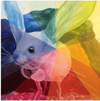
APRIL ART SHOW EVENT